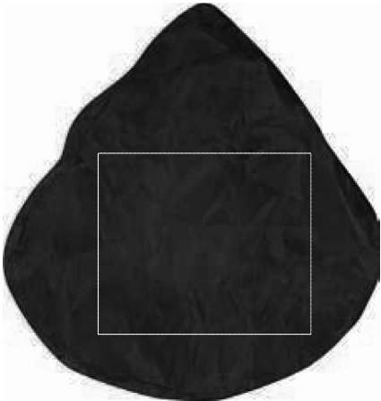
2. FRONT TRANSFER