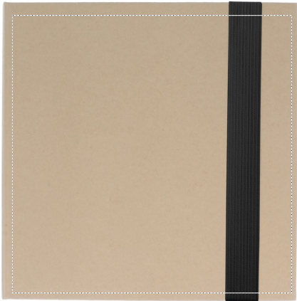
4. FRONT SCREEN