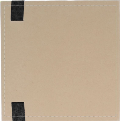
5. BACK SCREEN